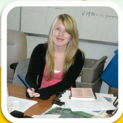
Jessica Deer @ The Eastern Door Reporter / Photographer